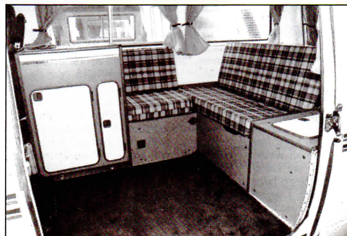
Westfalia interior is spacious and offers lots of storage space.

With the quality of British VW conversions now extremely high, the Westfalia, once the ultimate, has serious rivals. It will appeal to those who demand something a little different. The one on show at D & S certainly was, with its jazzy green upholstery. I couldn't decide whether it was setting the trend for tomorrow or harking back to the Odeon age of the 'thirties. JH.