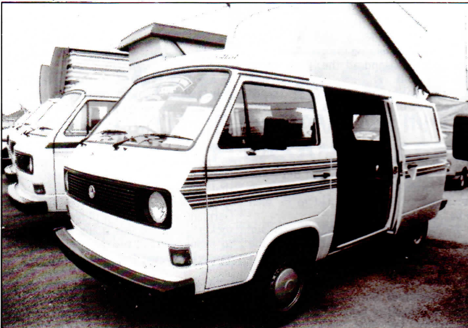
Westfalia VW with distinctive roof.

Outside there is a roof rack, ladder and spare wheel carrier and a special silver-blue on white paint finish. It's a motorhome that will appeal to buyers who demand all home comforts without the bulk of the conventional coachbuilt.