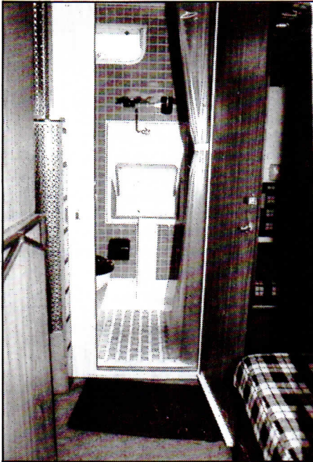
Arca's spacious toilet compartment has few rivals today.